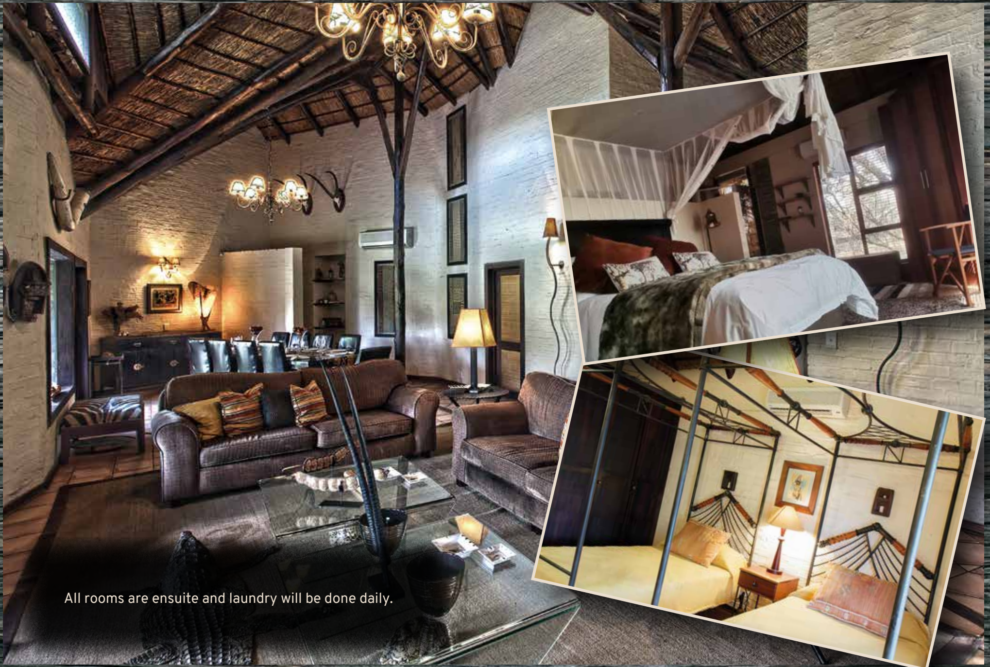
All rooms are ensuite and laundry will be done daily.